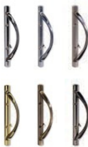
"VERONA" SERIES WITH TWIN-POINT LOCK AND KEYED OPTION

Standard hardware package in Black, White and split-finish Black Out/White In.