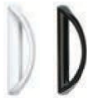
STANDARD "SIENA" SERIES WITH TWIN-POINT LOCK AND KEYED OPTION

Standard hardware package in Black, White and split-finish Black Out/White In.