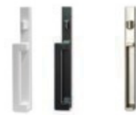
"SAN REMO" SERIES "AND KEYED OPTION"

Grip set series, a more contemporary look, with square d-handle for modern decor and design. Available in Black, White, split-finish Black Out/White In and Satin Nickel.