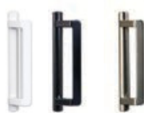
"SORRENTO" SERIES "AND KEYED OPTION"

(l to r) Brushed Chrome, Bright Chrome, Satin Nickel, Bright Brass, Antique Brass, Black, Nickel and Oil-Rubbed Bronze ( not shown ).