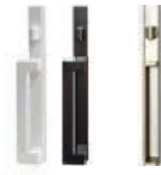
San Remo Slim or San Remo D