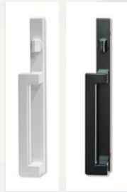
Standard White & Black